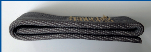
six-ply sewing for seatbelt

The use of the advanced controlled, heavy duty feed mechanism provides excellent, superb stitch quality and tight stitching even for extra-heavy sewing applications. Also, the upper thread feeding device which supplies the necessary length of upper thread at the start of sewing, preventing the thread from pulling-out regardless of the material feeding amount.